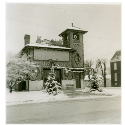
Eagle Fire Co. No. 7 engine house decorated for Christmas.

The Rescue engine house opened up at 10:00 a.m. for the neighborhood. The Rescue Fire Company Band, made up of about 30 members of the company, provided music on Christmas morning at their engine house. The station had been decorated both inside and out, and for two hours the firemen distributed candy, oranges and bananas, and other gifts to the children. No estimate of the number of children was provided.